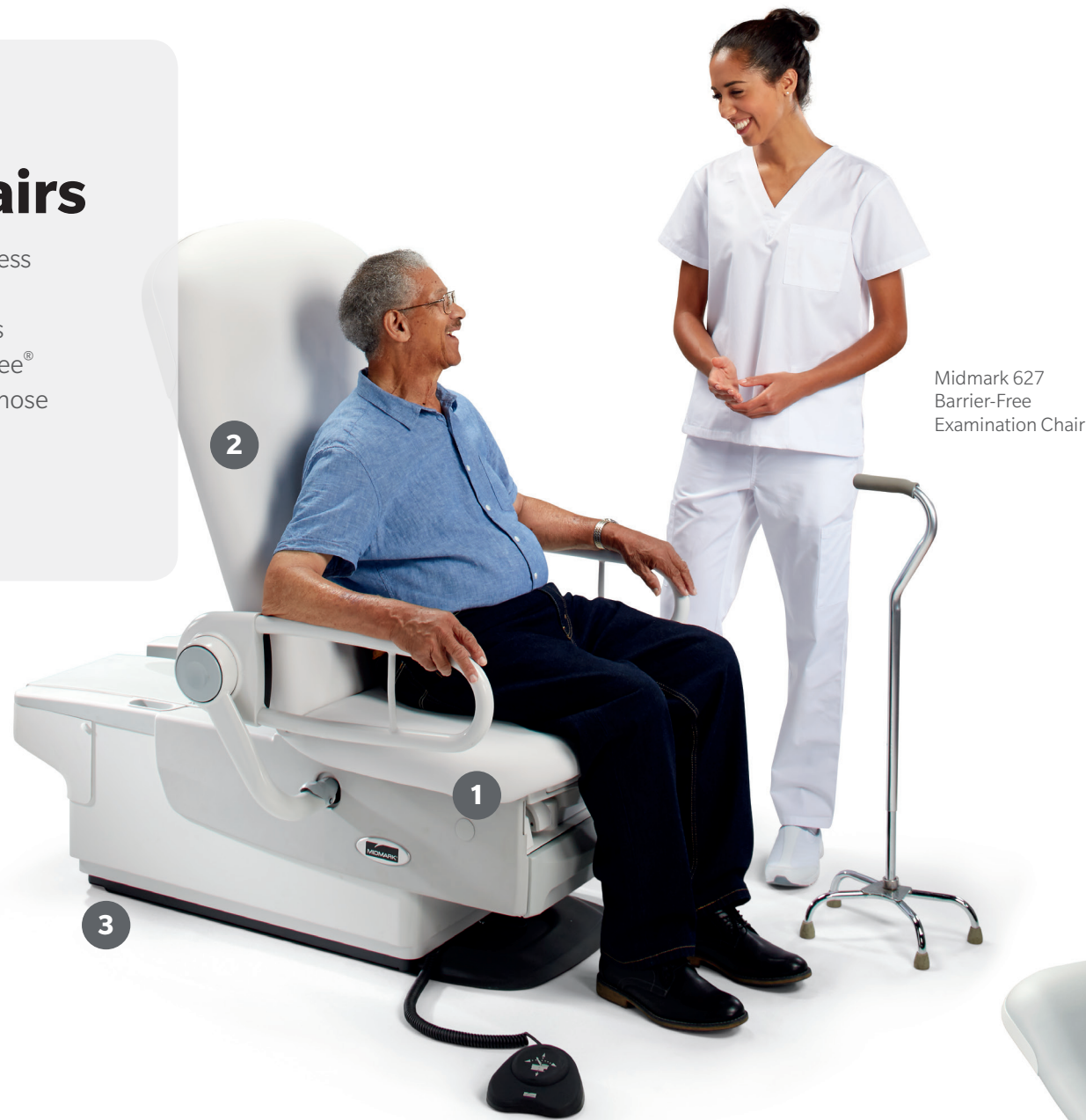
Midmark 627 Barrier-Free Examination Chair

Accessibility in healthcare goes beyond the ability of patients to access the care they need. The physical accessibility of a facility and the equipment within it plays a significant role. The proper exam chair is important in providing a thorough examination. Midmark Barrier-Free® examination chairs make accessing the exam chair easier, even for those with mobility concerns.