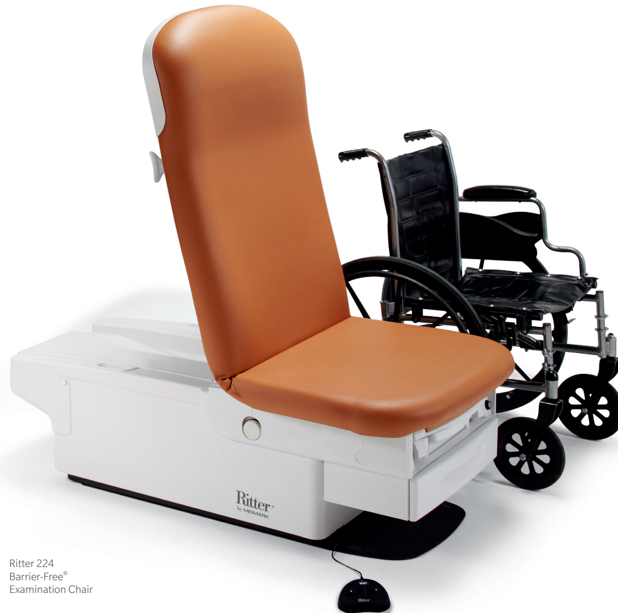
Ritter 224 Barrier-Free® Examination Chair